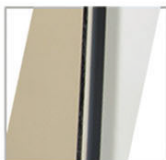
Double Layer 1.2mm sheet metal surface, melamine board inward.